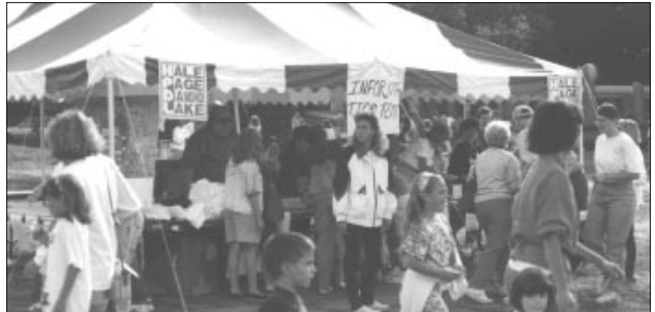
HPDL volunteers gave out tickets for free pop and ice cream bars at the information tent.

The target date for distributing the survey is September 26, 1992. On that day HPDL volunteers will hand deliver over 4400 sur-