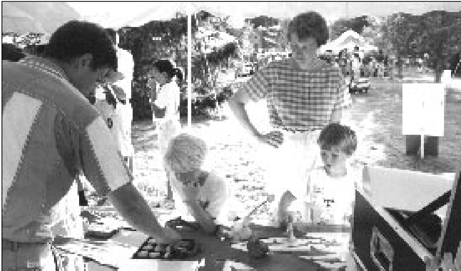
The Science Museum's Shark Exhibit drew the attention of inquiring minds at the picnic.