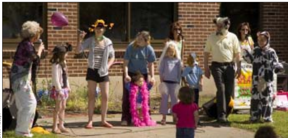
Family Fun Day at Hale School

This committee is responsible for promoting and supporting block club development in the neighborhood and providing information and education to residents and business owners in order to promote personal and property safety. The committee currently meets on the 2nd Tuesday of the month at 6:30 pm. Committee members are also involved in planning and organizing a community meeting in March and providing information at other events throughout the year.