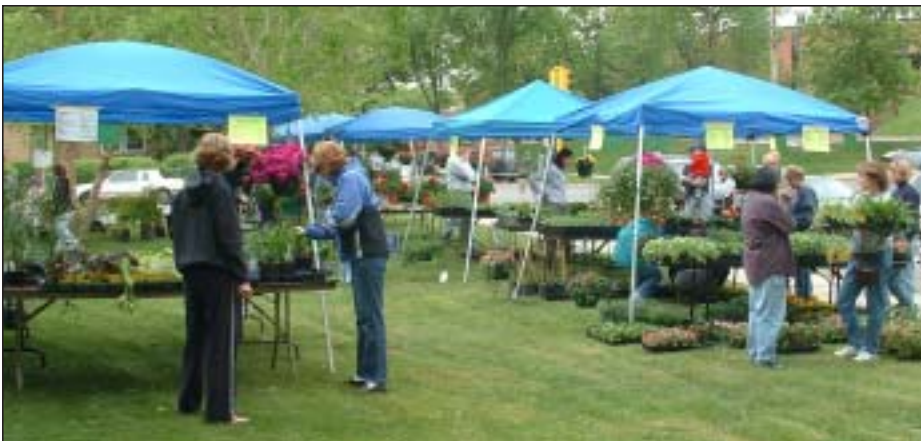
The green of Spring brings an urge to plant a garden, a great big garden.

Watch for dates and further information soon!