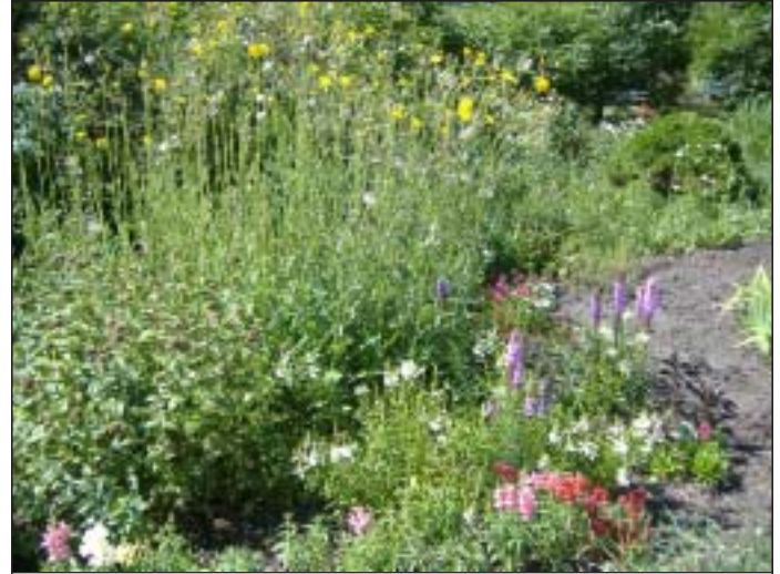
Bright sun produces colorful blooms at Pearl Park.