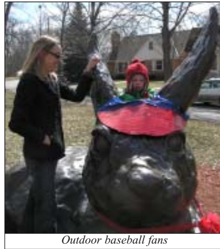
Outdoor baseball fans