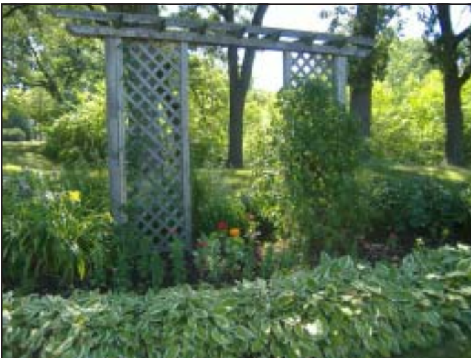
Hostas circle the Bloomington Ave garden.

Make that call to help by contacting the HPDL Office at 824-7707. Thank you!