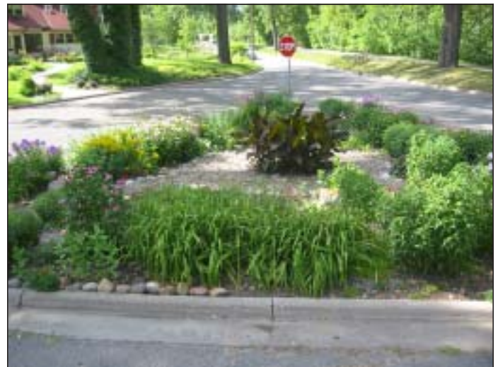
The Park Avenue garden's triangle includes a footpath.