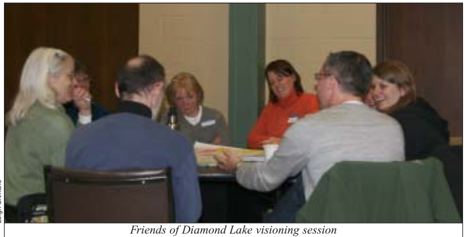
Friends of Diamond Lake visioning session

The next step will be to prioritize the ideas presented as part of the management plan development. This will take place on Thursday, April 28, 7:00 pm at Pearl Park, as part of the Friends of Diamond Lake annual meeting, which is open to the public. The Friends of Diamond Lake boards thank all who participated, and look forward to working with the community to preserve and protect Diamond Lake and its watershed.