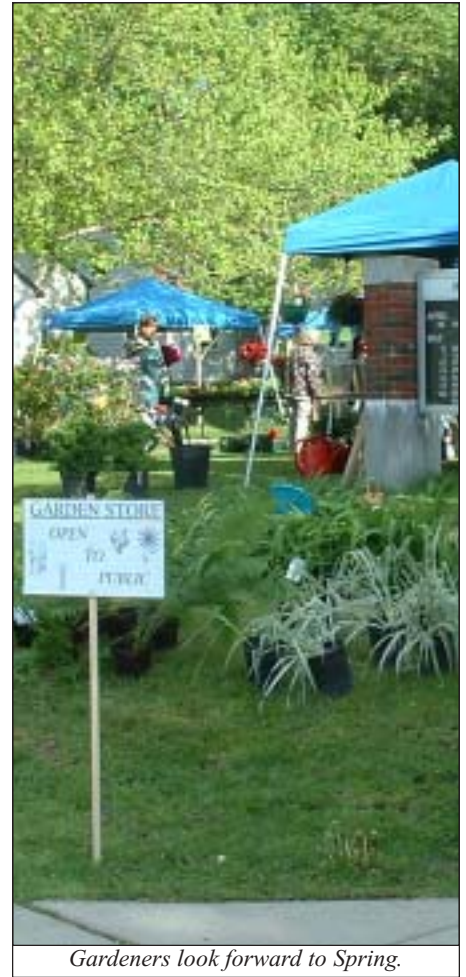
Gardeners look forward to Spring.

A great opportunity has been made available to HPDL and nearby neighborhood residents and artists. For the second year, the Picnic in the Park event in July is offering free exhibitor space to artists. Over 2,000 people attend the picnic each year to celebrate the community and enjoy the fun attractions. Call or email the HPDL office at 612-824-7707 or office@hpd.org and ask for a registration form if you are interested in participating this year. All exhibitors who sign up for an arts booth must bring a door prize to be given away at the event.