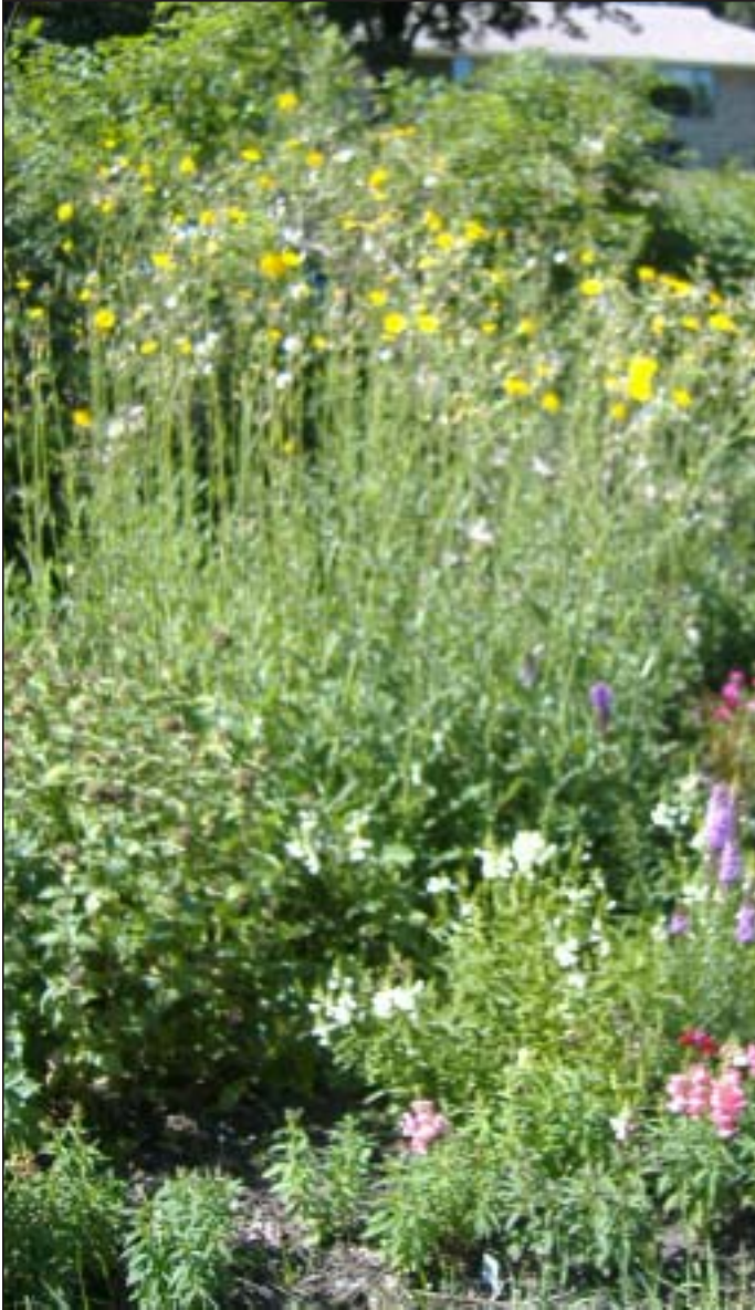
The Pearl Park garden has lots of room.