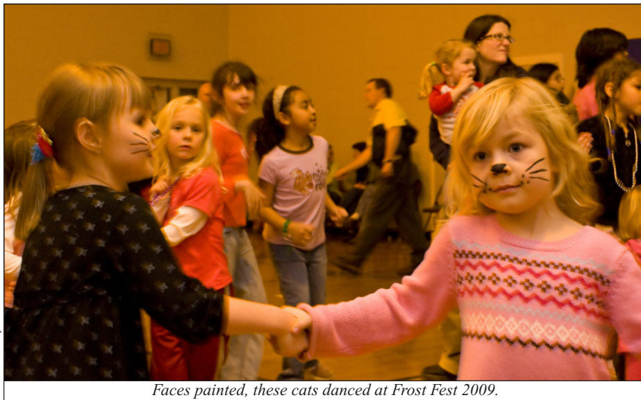
Faces painted, these cats danced at Frost Fest 2009.

2009 Frost Fest was a huge success!! With as much snow and cold weather as we have had this year how could a celebration of winter not be successful? Parents and kids of all ages filled the Pearl Park community center for good food, music and games galore, including the ever-popular cake walk. Frost Fest goers could also do craft projects and get their faces painted. The warming room was a busy place as skaters and hockey players suited up for visits to the rinks behind the community center. Marshmallow roasting was also a big hit. Kids' Dance DJ kept the younger folks (and some older ones too!) moving and grooving. A new attraction this year, the Wii was a big hit, and Frost Fest organizers are happy to report that the tv screen escaped unscathed. A big thanks to Fat Lorenzos and Carbones Pizza for donating the evening's door prizes. Another big thanks to Fat Lorenzo's and Pearl Hockey for the great food served.