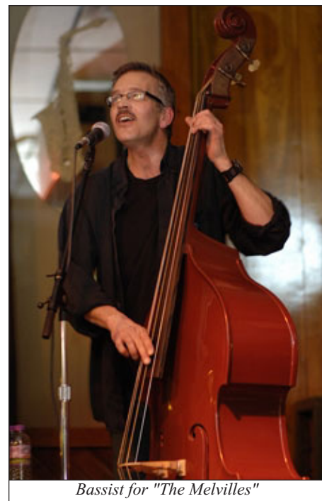
Bassist for "The Melvilles"