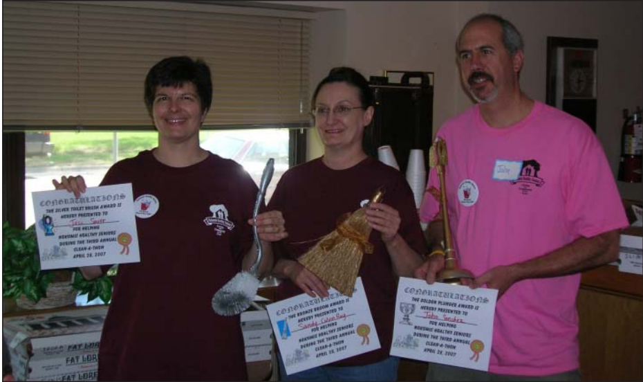
Clean-a-thon Award Winners show off their hardware.