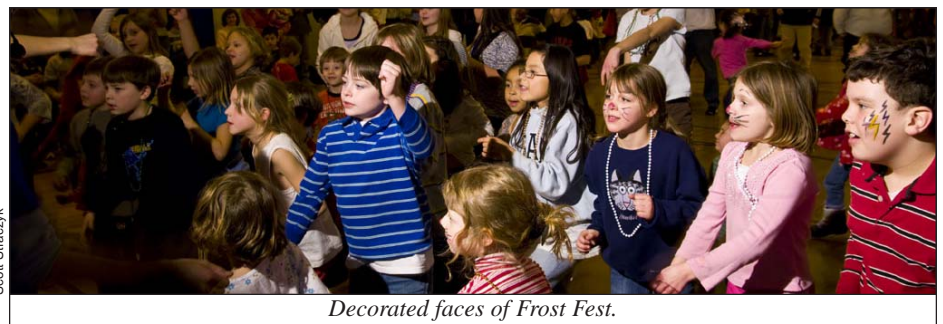
Decorated faces of Frost Fest.

On Saturday, March 8th, from 10 a.m. to 3 p.m., the South Minneapolis Housing & Home Improvement Fair will take place at South High School located at 3131 19th Avenue South. This year marks the fourteenth annual Housing Fair, which has become one of the most successful and well-attended neighborhood based events in Minneapolis drawing over 2,000 attendees annually.