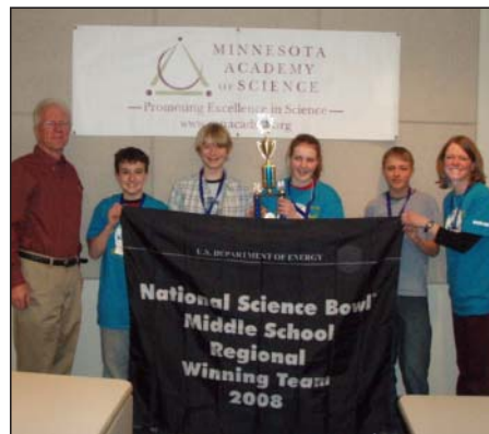
Field Community School Team 1 won 1st place and a June trip to Colorado to compete in the National Science Bowl.