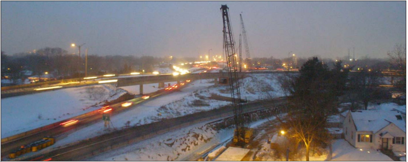
Work continues on the 35W/Crosstown East interchange. The bridge at Diamond Lake Road opened in December, ahead of schedule.

http://oxblue.com/propert?webPath=crosstown