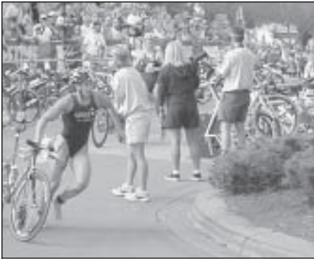
Swimmers grab their bicycles.