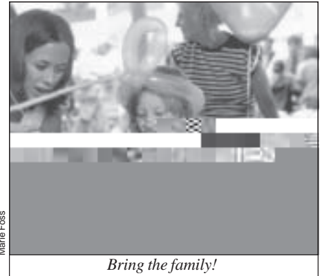
Bring the family!

When you've worked up a little hunger, there will be lots of fresh food for you to