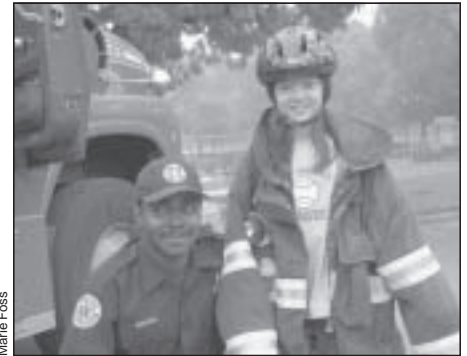
A firefighter's coat kept the rain out.

Splashing was not a planned activity at the 1st annual HPDL Bike Rodeo and Safety Fair, but the drizzling rain seemed to add an extra drop of fun to the event. Despite the occasional need for the opening of an umbrella, there were around fifty HPDL parents and kids who stopped by Pearl Park on Saturday, May 22, 2004, to join the fun.