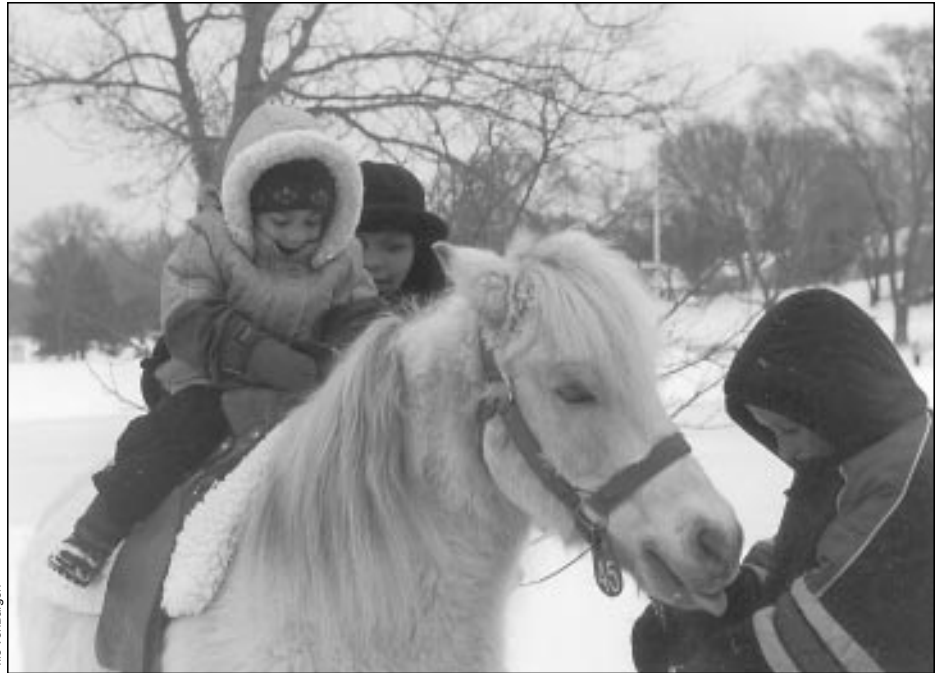
Horse rides were a new addition to Frost Fest 2001.